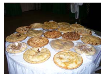
SUPER APPLE PIES!!